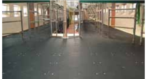
Newly fitted Kraiburg rubber in parlour and collecting area

Kraiburg KURA P matting has recently been fitted at Ian Smith's of New Greentowers, Lanark. He comments "Covering the concrete where the cows stand has made a big difference to cow flow in and out of the